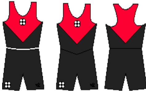
Top & Shorts