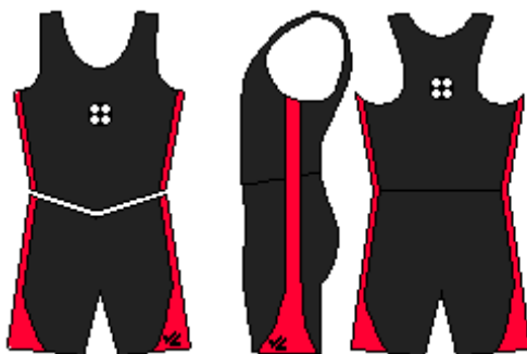
Top & Shorts