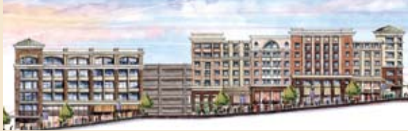
The Beacon of Groveton

Approximately 213,000 people live within a five-mile radius of Richmond Highway, and 45% of households earn $100,000 per year or more. New mixed-use projects will add new residents, and more opportunities for them to live, shop, play, and work on the highway.