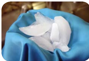
Use an ice pack