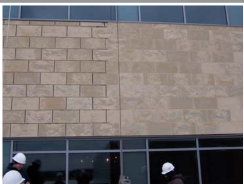
Step 7: Joints Sealed with Backer Rod and Silicone Sealant