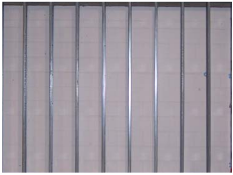
Step 1: Steel Studs