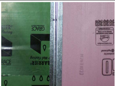
Step 4: Install "Z" channels and then Rigid Insulation between "Z" channels