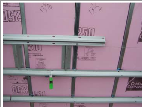
Step 5: Install Gridworx Channels over "Z" channels and rigid insulation