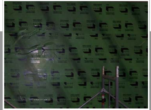
Step 3: Waterproofing Membrane