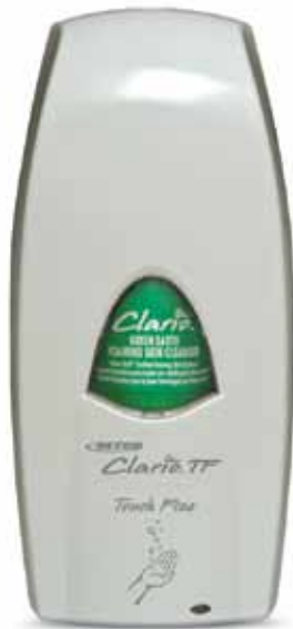
91866-00 6/case - White Foam Only