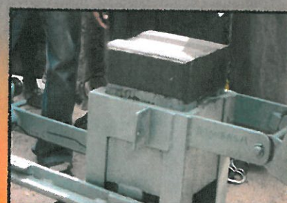
The project offering for this year's missions month was a block making machine. We raised 100,000 ksh ($1000) to buy the machine to build church buildings in S. Sudan.