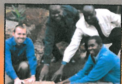
This photo shows the current leadership at KBC. We were all giddy as school boys with excitement about setting the stone and beginning the OBC church building project!