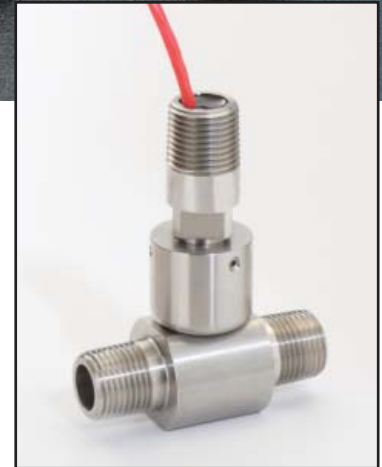
Turbine meter shown with Mag-PB sensor