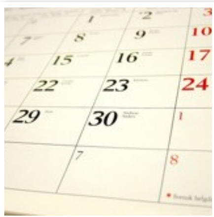
Upcoming events and activities for your teenager.

Coming up in the month of October the Youth Ministry will be having a competition between the guys and the girls to see which side can raise the most money in the month of October. Each Wednesday, there is going to be a special offering to help pay for an air hockey table and some other things for the youth room of Liberty Baptist Church. We would love to have as many parents support as possible. The first of five offerings will begin October 5th, 2011. We'll be sending more reminders out in the coming weeks.