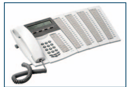
Ericsson Dialog 4000 Digital Telephone

Ericsson Enterprise AB SE-126 25 Stockholm www.ericsson.com/enterprise