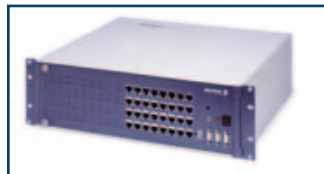
Ericsson BusinessPhone 128i