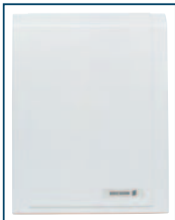
Ericsson BusinessPhone 50

BP128i is a single, compact cabinet with five board slots. Since it is possible to stack two systems, it can serve up to 128 extensions and 60 trunks. The cabinet has a built-in switched mode power supply.