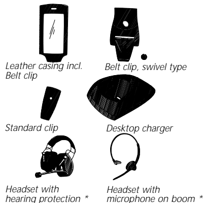
Leather casing incl. Belt clip

The following accessories for the 9d24 are available: