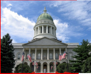
Maine State House, Augusta, Maine